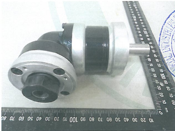
Front view of P-Series II R